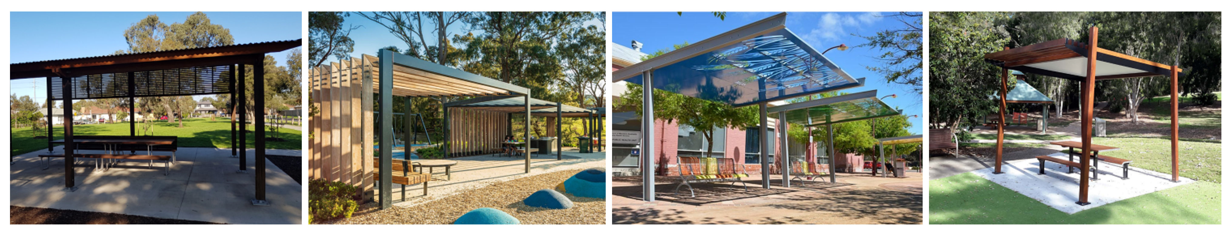
Proposed contemporary update to main and picnic shelter