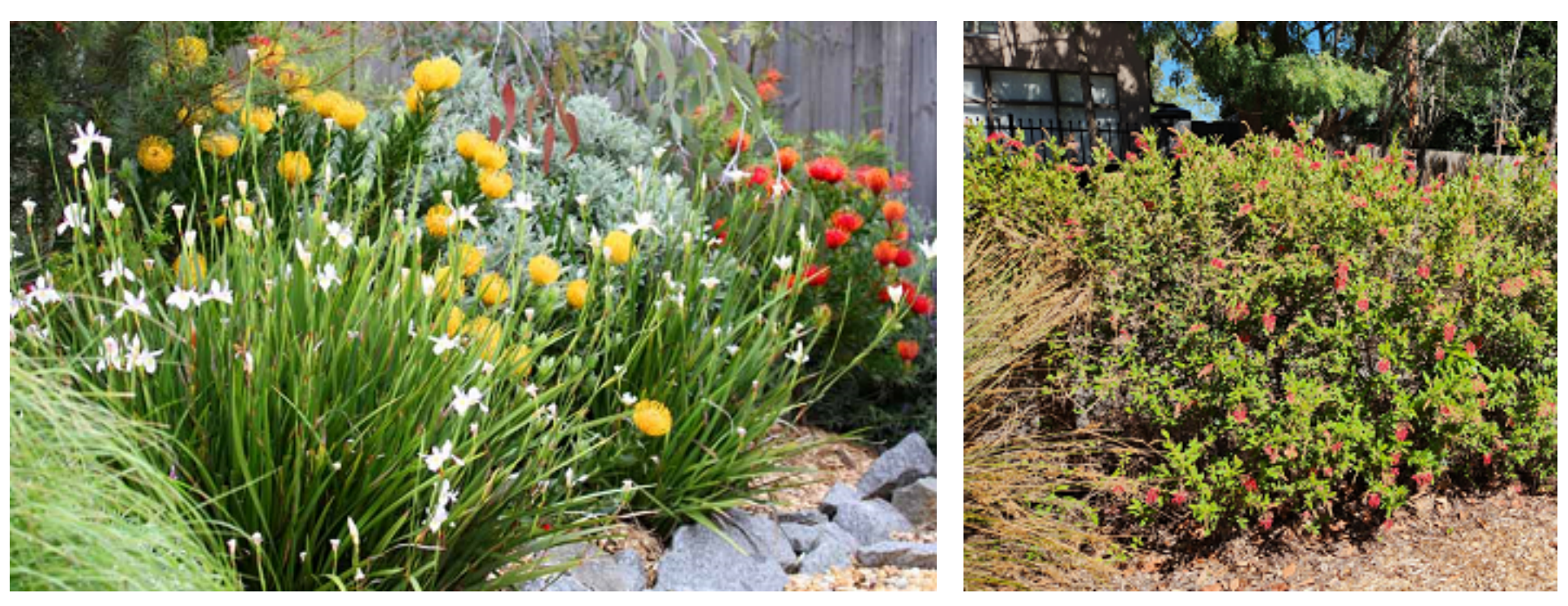
Proposed low native planting to perimeter of park, final species to be confirmed

Wurundjeri Woi Wurrung Country Parkville Street, Burnley VIC