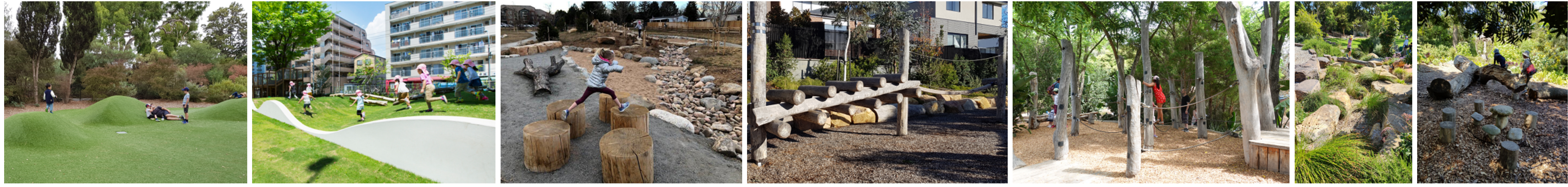
Proposed land form for play

Proposed play structures to cater for all ages and social inclusion, final design to be determined