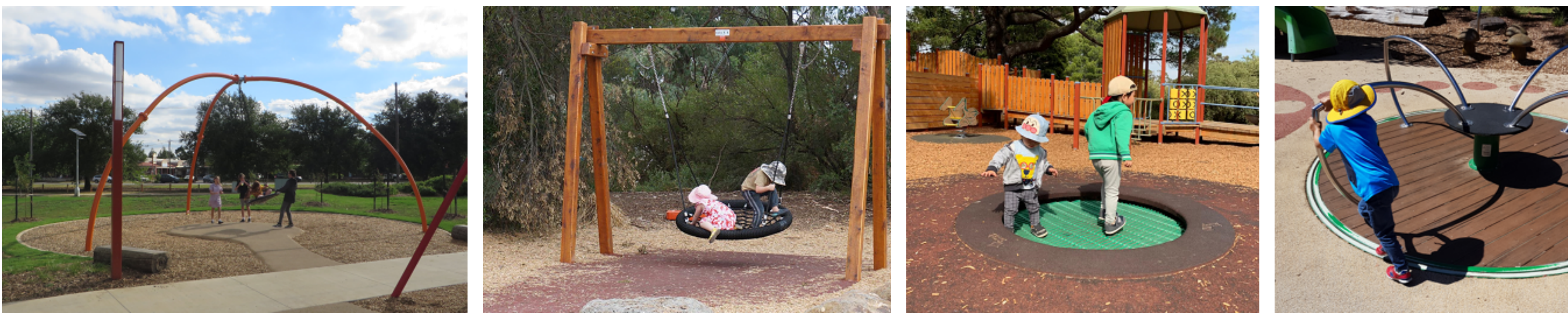
Proposed play equipment to promote social inclusion