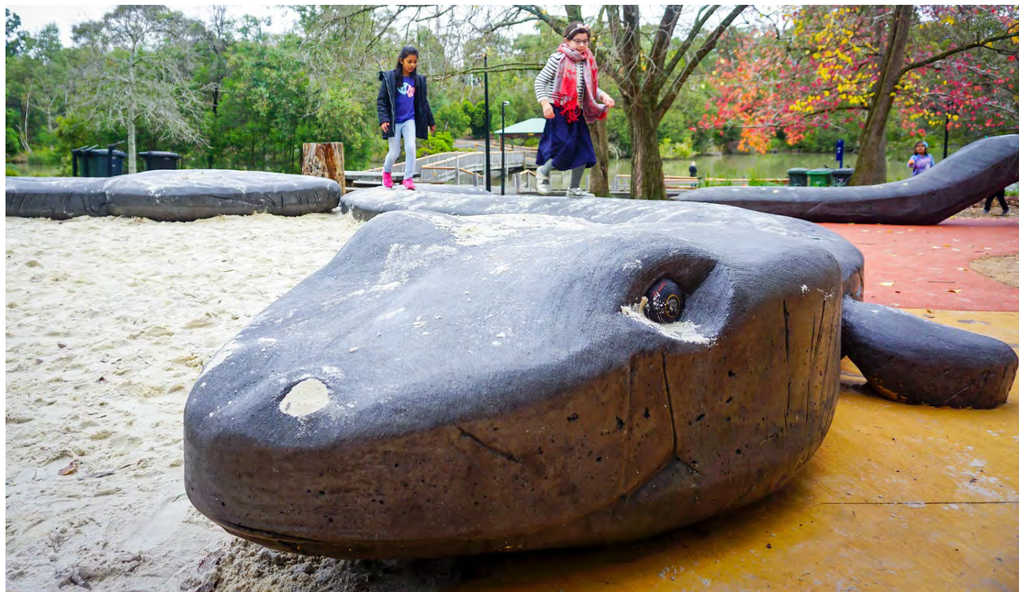
Carved Sculpture and Sand Play Features