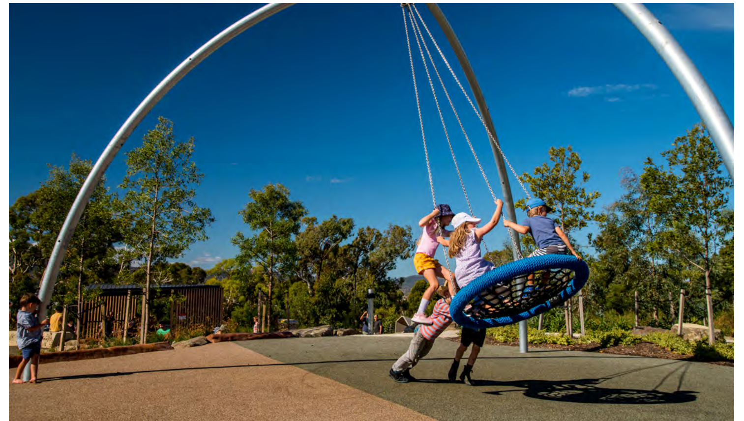
Single Point Swing