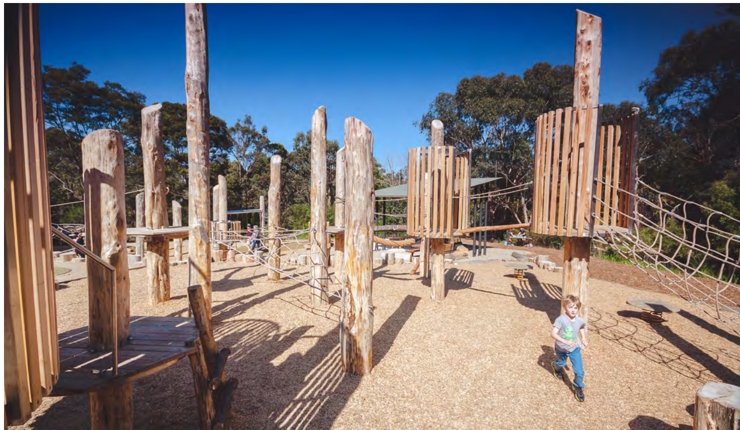
Timber Multi-Play Tower with Scramble Nets and other Climbing Elements