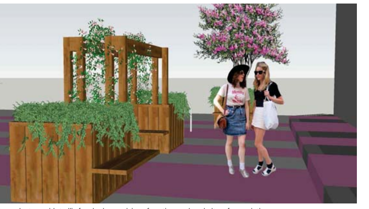
Visualisations to illustrate a typical arrangement of raised planters and bicycle racks at a pause point, with individual tree planters, planters with trellis for shade, provision of seating, and asphalt surface painting.